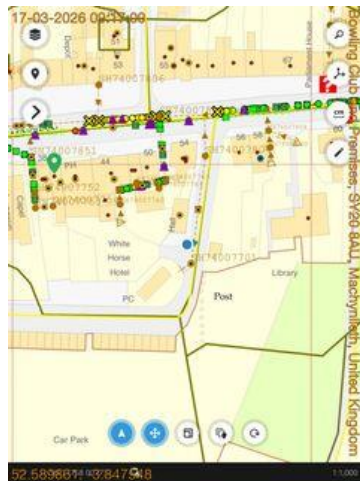
Photo of area needing further works 1

Additional notes regarding further works In notes